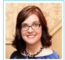
Executive Director Alpha Omega Center